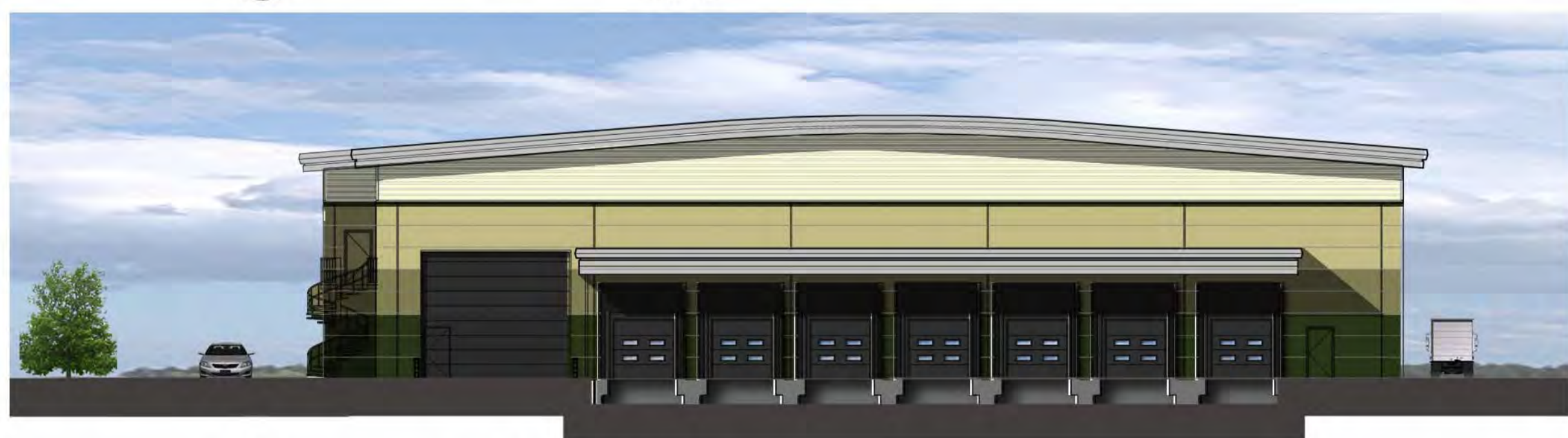
04 NORTH ELEVATION 204 1:200