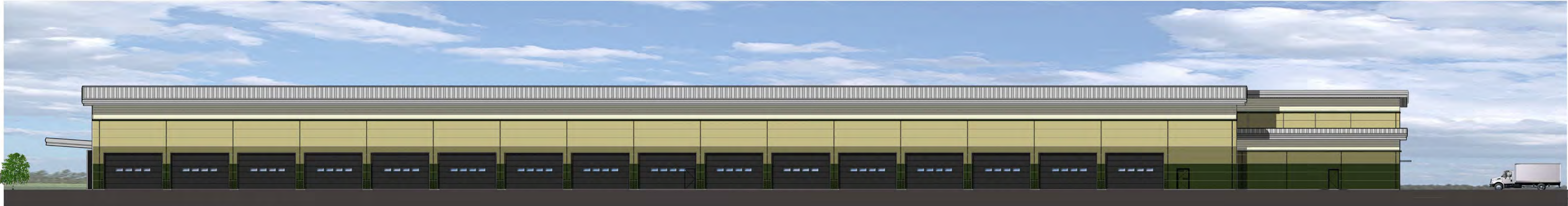
01 WEST ELEVATION 204 1:200