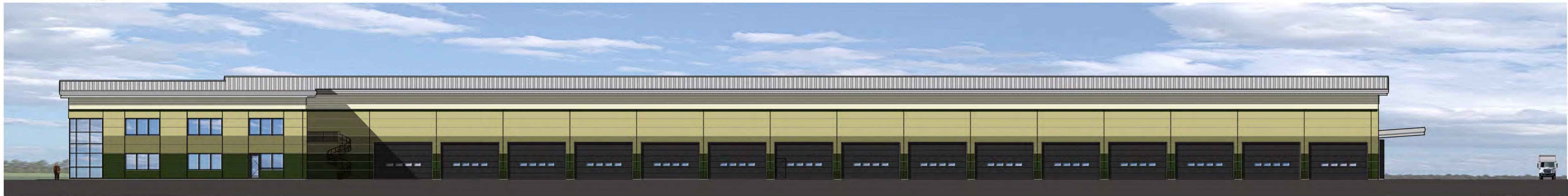
02 EAST ELEVATION 204 1:200